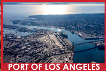
PORT OF LOS ANGELES