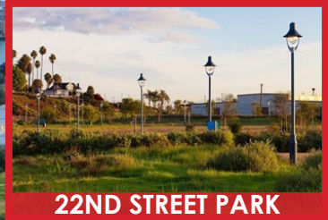
22ND STREET PARK

11,000 SF Flat Industrial Lot near the Marina, Great Coastal Location!