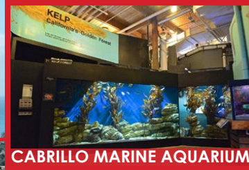
CABRILLO MARINE AQUARIUM