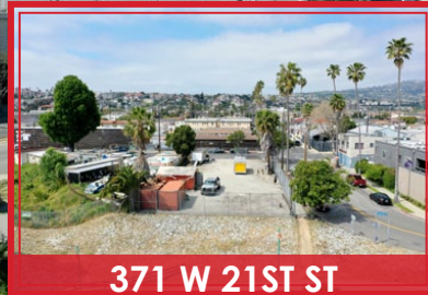
371 W 21ST ST