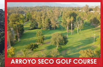
ARROYO SECO GOLF COURSE