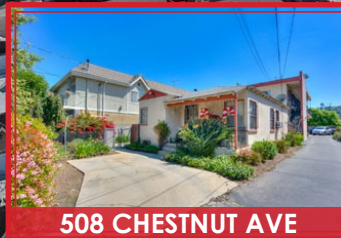
508 CHESTNUT AVE