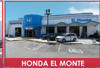
HONDA EL MONTE