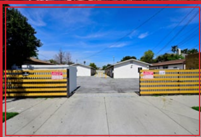
11513-515 MEDINA CT