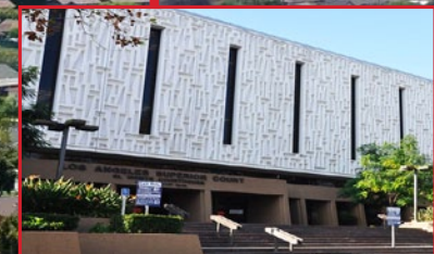
EL MONTE COURTHOUSE POLICE DEPARTMENT