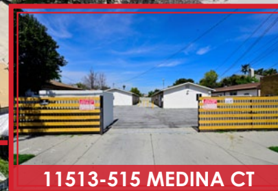
11513-515 MEDINA CT

Most errands can be accomplished on foot.