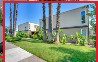
278 E WASHINGTON BLVD