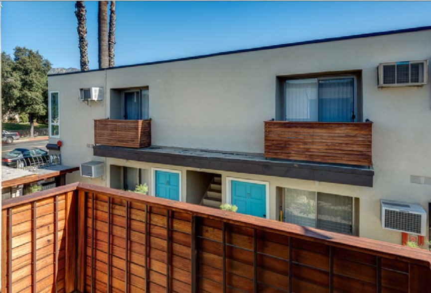
PRIVATE BALCONY FOR MANY UNITS