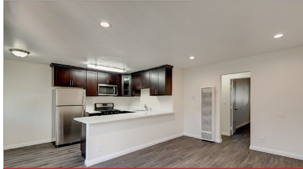
SPACIOUS OPEN FLOOR PLAN UNITS