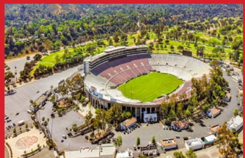
ROSE BOWL AREA