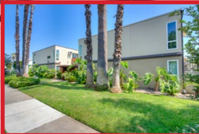
278 E WASHINGTON BLVD