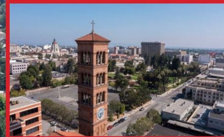
OLD TOWN PASADENA