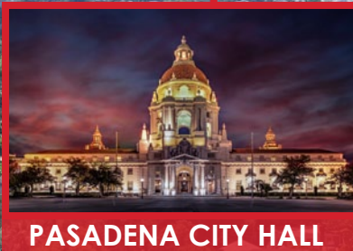
PASADENA CITY HALL