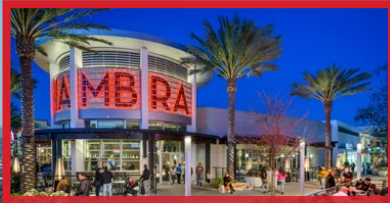
CITY OF ALHAMBRA