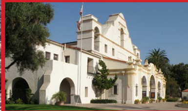
CITY OF SAN GABRIEL