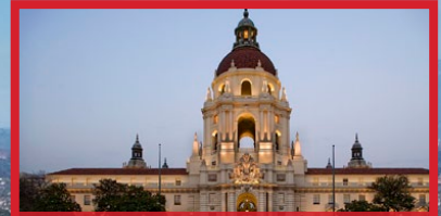
CITY OF PASADENA