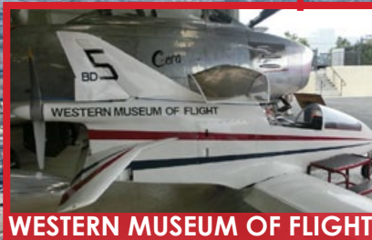
WESTERN MUSEUM OF FLIGHT