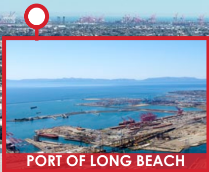
PORT OF LONG BEACH