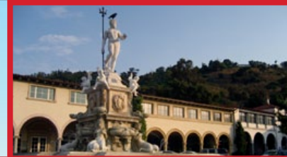
PALOS VERDES ESTATES