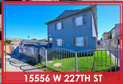
1556 W 227TH ST