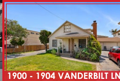
1900 - 1904 VANDERBILT LN