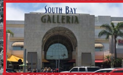
SOUTH BAY GALLERIA