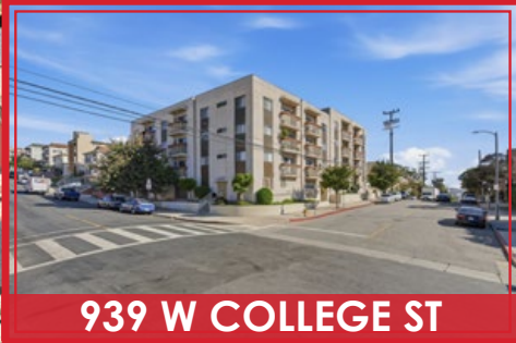
939 W COLLEGE ST