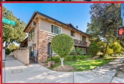
112 N MAR VISTA AVE