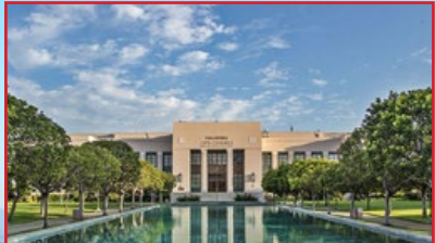
PASADENA CITY COLLEGE