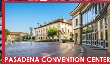
PASADENA CONVENTION CENTER