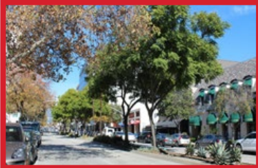
LAKE AVE DISTRICT