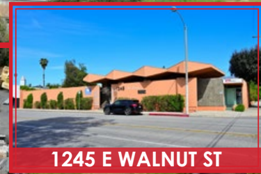
1245 E WALNUT ST