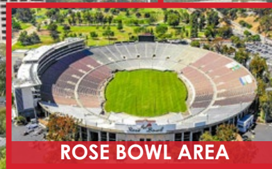
ROSE BOWL AREA