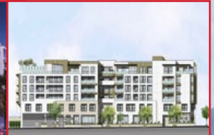
MANY NEW & Proposed Mixed-use/Housing on Walnut