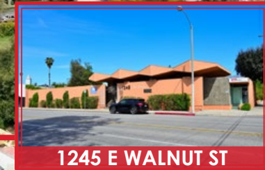
1245 E WALNUT ST