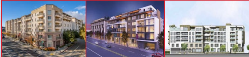
MANY NEW & Proposed Mixed-use/Housing on Walnut