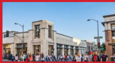
OLD TOWN PASADENA