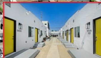
5928 S HOOVER ST