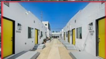
5928 S HOOVER ST